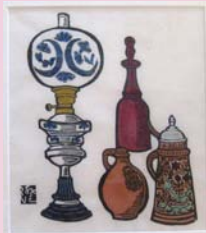
Woodblock of Sumio Kawakami