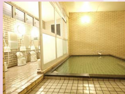
Clear simple Alkaline spring, rather soft even for sensitive skin.